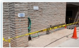
IMPROVEMENTS SEE THEM HERE