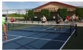
ACTIVITIES KEEPING BUSY